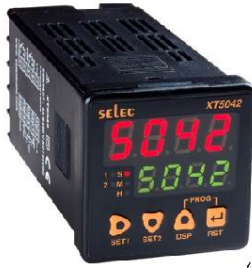
(48 x 48)