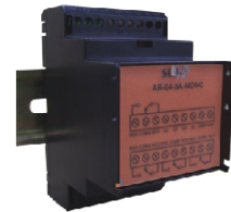
4 Relay Module