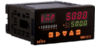
48 x 96