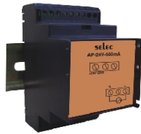
24 VDC Power Supply