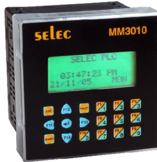
96 x 96